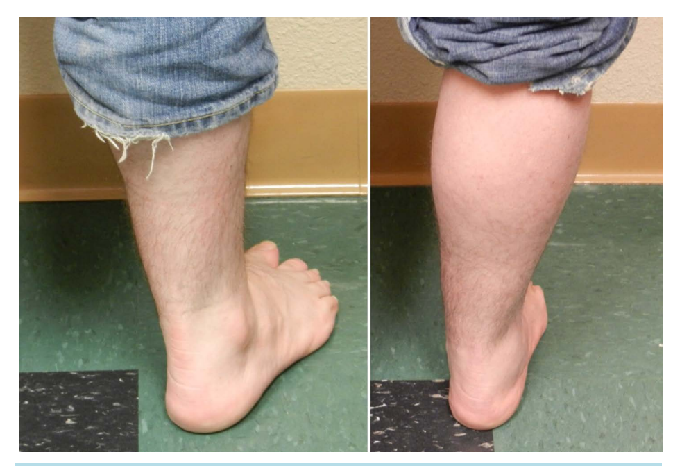
Figure 1. Patient ankle before and after Evans procedure with human amniotic allograft.

Human amniotic allograft has been commercially available over the last decade. It is an allograft derived from human amnion and amniotic fluid. The properties are specifically beneficial and those that have been studied contain multipotential stem cells, multiple growth factors, atrophic proteins including bone morphogenic proteins, hyaluronic acid and collagen precursors of types III, IV and V and proteoglycans [19]. Because of cellular