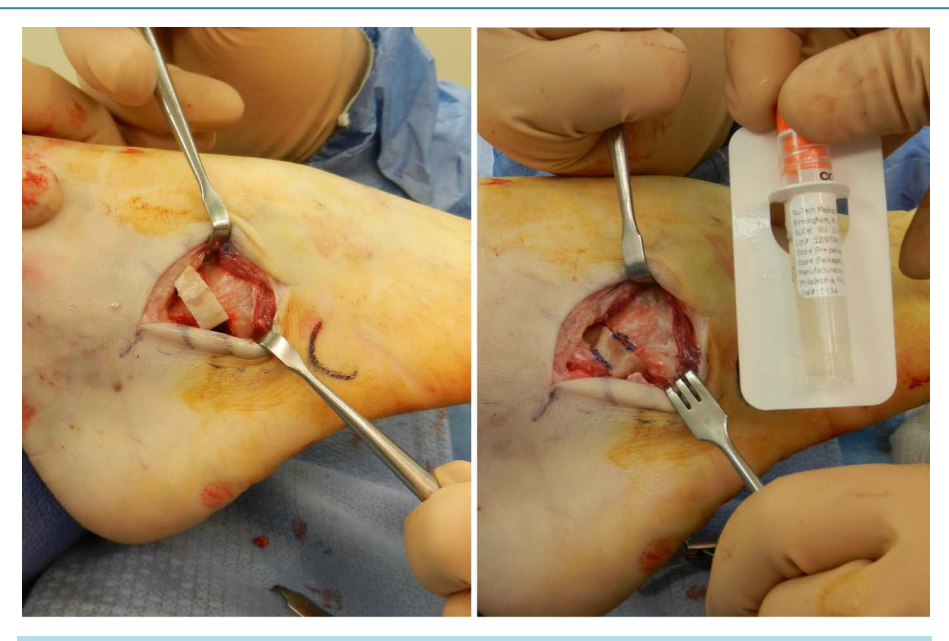
Figure 2. Patient intraoperative Evans procedure with liquid human amniotic allograft.